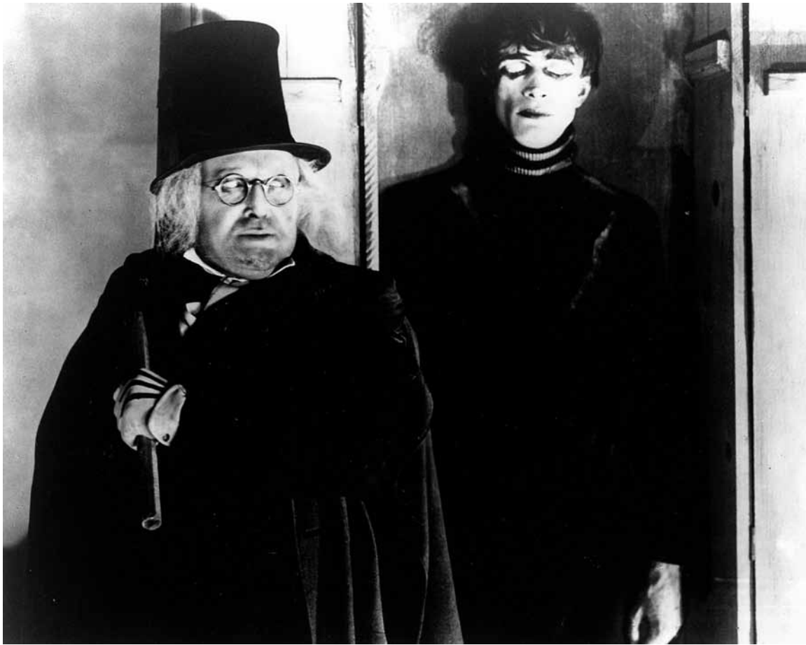
German Expressionism can be identified by severe disorienting perspective lines and stark color.