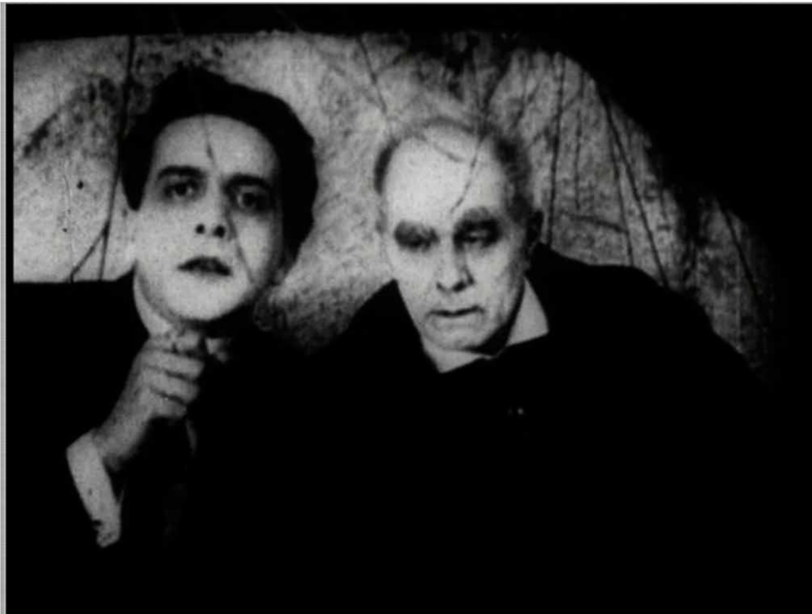
Still from the movie "The Cabinet of Dr. Caligari"