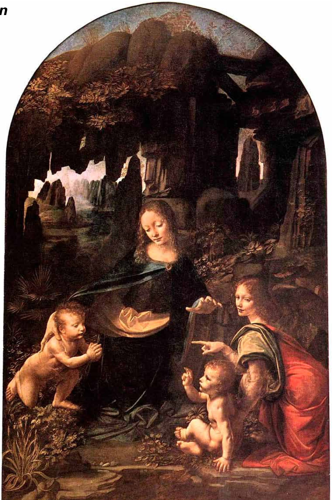
Leonardo Da Vinci "Virgin of the Rocks"

Triangular composition whose spatial relationship holds to the same ratio as the Golden Proportion which is 1:1.618