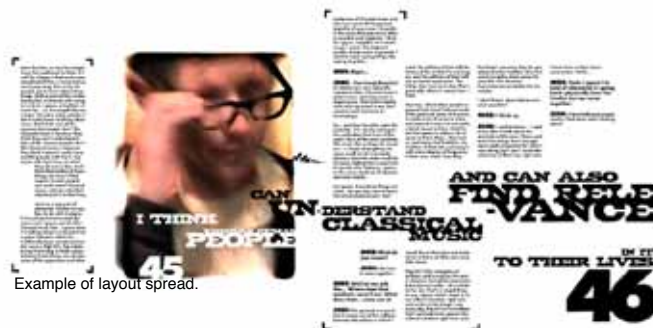
Example of layout spread.

Analyze why these ads and these magazine spreads are interesting. What generates interest? Composition, changes and variances in size and position of pull quotes and title.